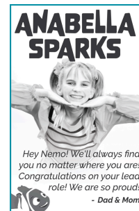
STUDENT AD EXAMPLE (1/4 PAGE)