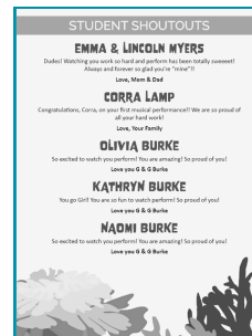
SMALL SHOUT-OUT EXAMPLE

All ads are put together by our in-house designer unless otherwise requested.